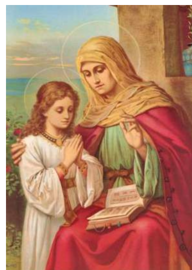
Ste. Anne Parish 6836 Huron St., Mackinac Island Saturday at 5:30 p.m. Sunday at 8:30 a.m. Sunday at 10:30 a.m. Established in 1670