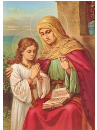
Ste. Anne Parish 6836 Huron St., Mackinac Island Saturday at 5:30 p.m. Sunday at 10:30 a.m. Established in 1670 Established in 1670