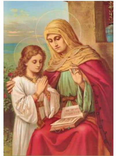
Ste. Anne Parish 6836 Huron St., Mackinac Island Sunday at 10:30 a.m. Established in 1670