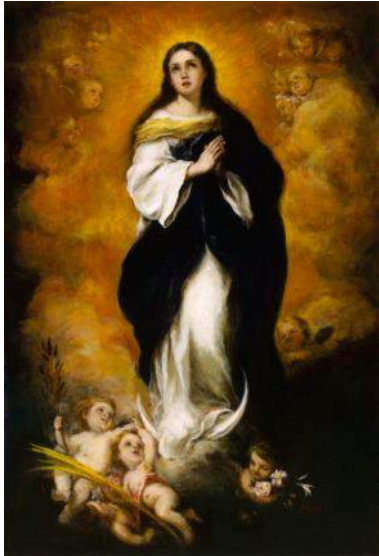
Immaculate Conception Parish W1934 Church St., Moran, MI Off of M-123 Sunday at 11:00 a.m. Established in 1941