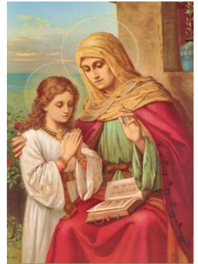
Ste. Anne Parish 6836 Huron St., Mackinac Island Sunday at 10:30 a.m. Established in 1670