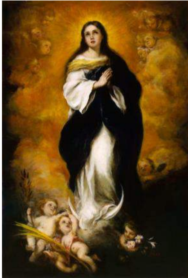
Immaculate Conception Parish W1934 Church St., Moran, MI Off of M-123 Sunday at 11:00 a.m. Established in 1941