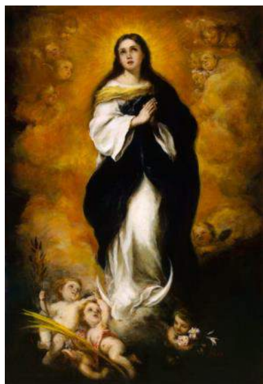
Immaculate Conception Parish W1934 Church St., Moran, MI Off of M-123 Sunday at 11:00 a.m. Established in 1941