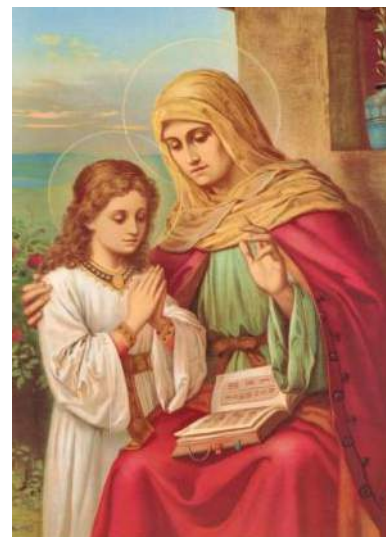
Ste. Anne Parish 6836 Huron St., Mackinac Island Sunday at 10:30 a.m. Established in 1670