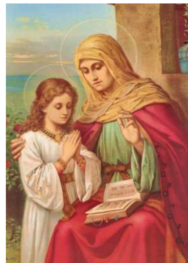
Ste. Anne Parish 6836 Huron St., Mackinac Island Sunday at 10:30 a.m. Established in 1670