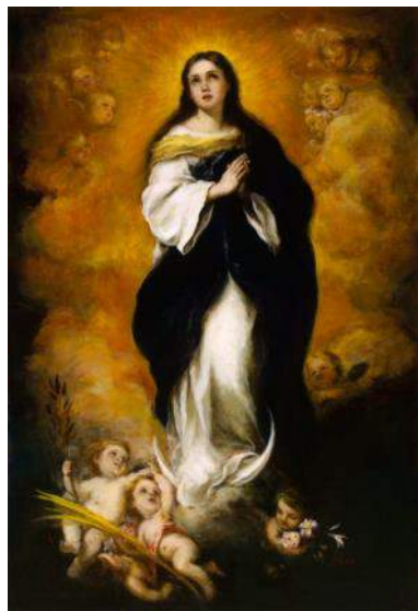
Immaculate Conception Parish W1934 Church St., Moran, MI Off of M-123 Sunday at 11:00 a.m. Established in 1941