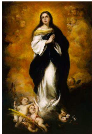
Immaculate Conception Parish W1934 Church St., Moran, MI Off of M-123 Sunday at 11:00 a.m. Established in 1941