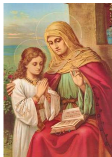
Ste. Anne Parish 6836 Huron St., Mackinac Island Sunday at 10:30 a.m. Established in 1670