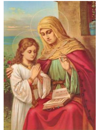
Ste. Anne Parish 6836 Huron St., Mackinac Island Sunday at 10:30 a.m. Established in 1670