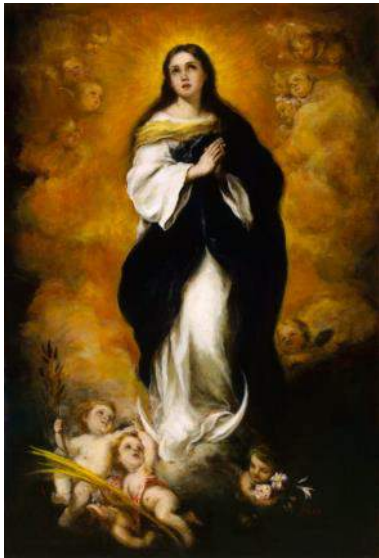
Immaculate Conception Parish W1934 Church St., Moran, MI Off of M-123 Sunday at 11:00 a.m. Established in 1941