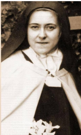
ST. THÉRÈSE OF LISIEUX

“Our Lord does not look so much at the greatness of our actions, or even at their difficulty, as at the love with which we do them.”