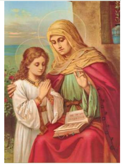
Ste. Anne Parish 6836 Huron St., Mackinac Island Sunday at 10:30 a.m. Established in 1670