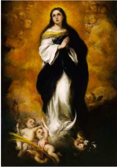
Immaculate Conception Parish W1934 Church St., Moran, MI Off of M-123 Sunday at 11:00 a.m. Established in 1941