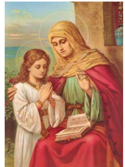
Ste. Anne Parish 6836 Huron St., Mackinac Island Sunday at 10:30 a.m. Established in 1670 Our Sister Parish