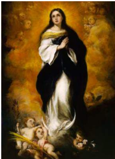
Immaculate Conception Parish W1934 Church St., Moran, MI Off of M-123 Sunday at 11:00 a.m. Established in 1941

THIRTY-THIRD SUNDAY IN ORDINARY TIME NOVEMBER 15, 2020