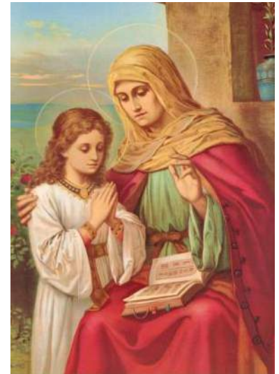
Ste. Anne Parish 6836 Huron St., Mackinac Island Sunday at 10:30 a.m. Established in 1670 Our Sister Parish