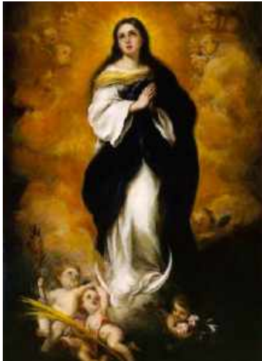
Immaculate Conception Parish W1934 Church St., Moran, MI Off of M-123 Sunday at 11:00 a.m. Established in 1941