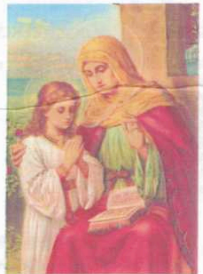
Ste. Anne Parish 6836 Huron St., Mackinac Island Sunday at 10:30 a.m. Established in 1670 Our Sister Parish