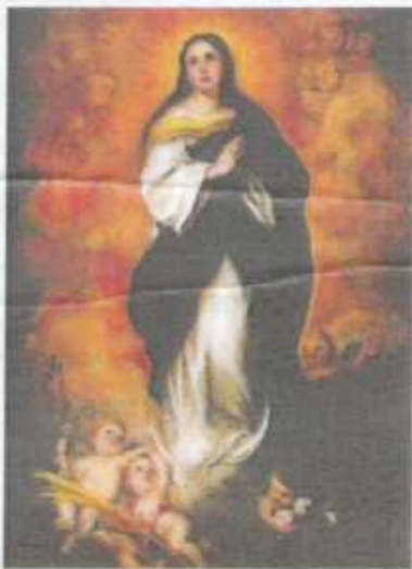
Immaculate Conception Parish W1934 Church St., Moran, MI Off of M-123 Sunday at 11:00 a.m. Established in 1941