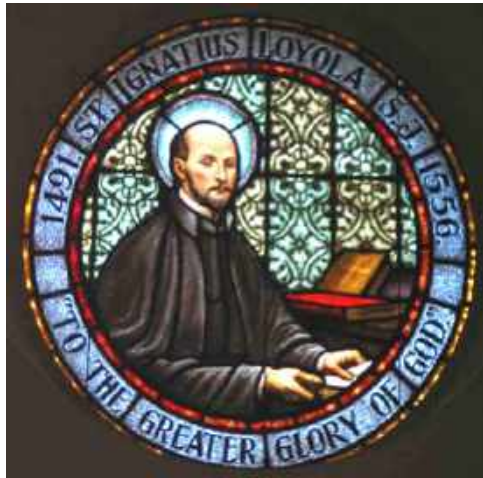
St. Ignatius Loyola Parish 120 Church St., St. Ignace, MI Weekday Tues. 5:30 p.m. W-F 8:30 a.m. Saturday at 5:00 p.m. Sunday at 9:00 a.m. Established in 1671