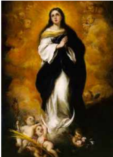
Immaculate Conception Parish W1934 Church St., Moran, MI Off of M-123 Sunday at 11:00 a.m. Established in 1941