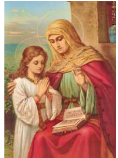
Ste. Anne Parish 6836 Huron St., Mackinac Island Sunday at 10:30 a.m. Established in 1670 Our Sister Parish