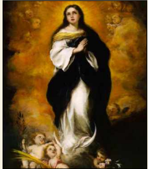
St. Ignatius Loyola Parish